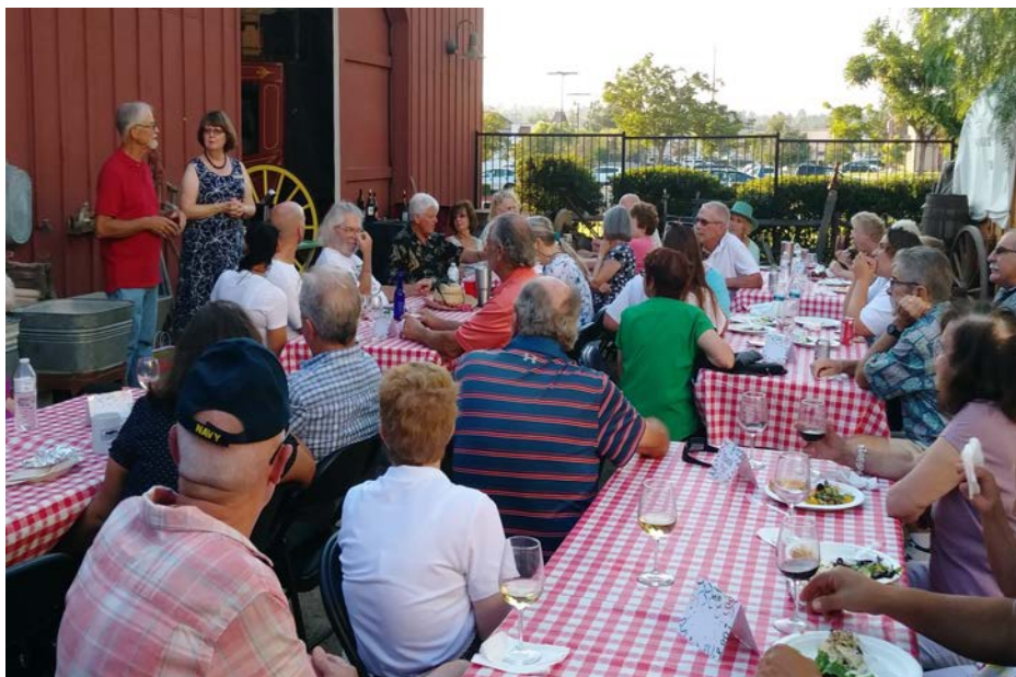
Recognizing our valued volunteers during special feast event at the History Center in the heat of an August evening this year.